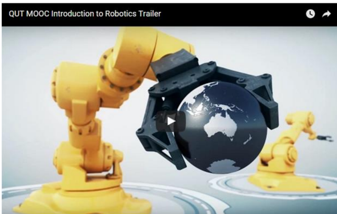
Figure 2. MOOC Introduction to Robotics.