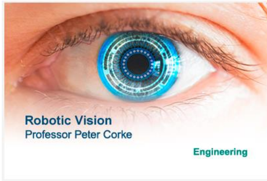
Figure 3. Robotic Vision.

By the end of this course you should be able to: