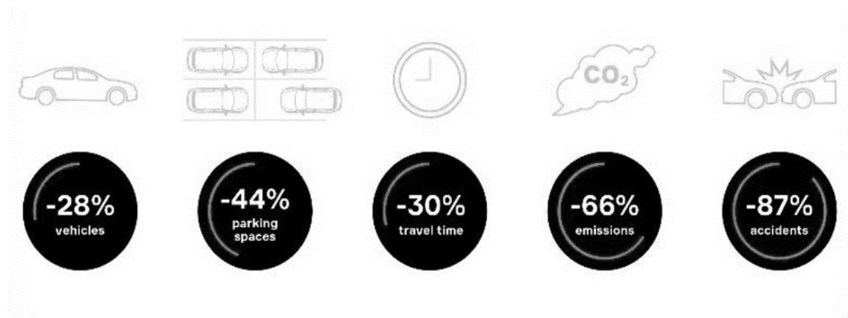
Figure 3. Economic and environmental benefits [3].

With a widespread car autonomy, it is expected that car ownership will become less common. As long as the seamless service is provided, owning a car may not be as important. According to RethinkX think tank, driverless cars will be fleet-owned, perhaps even by their manufacturers. They also predict that by the year 2030, the demand for new cars will drop by 80 %. This conclusion is based on an estimate that the use of autonomous cars will increase at least tenfold, which means fewer vehicles on the road. When it comes to autonomous cars, fossil fuels are not as practical as electric power, and the new infrastructure needed to charge electric batteries and the associated technology will create many jobs for the increasing population. In this sense, smart cars will contribute to the general effort to limit the use of fossil fuels and adopt greener forms of transport with minimal carbon emissions (Fig. 3.).