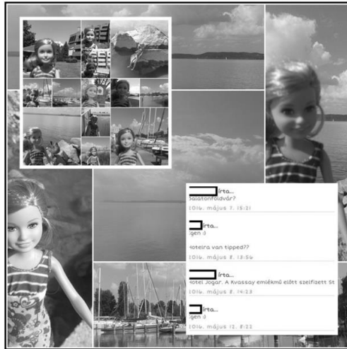
Figure 1. Photo montage from the online game.