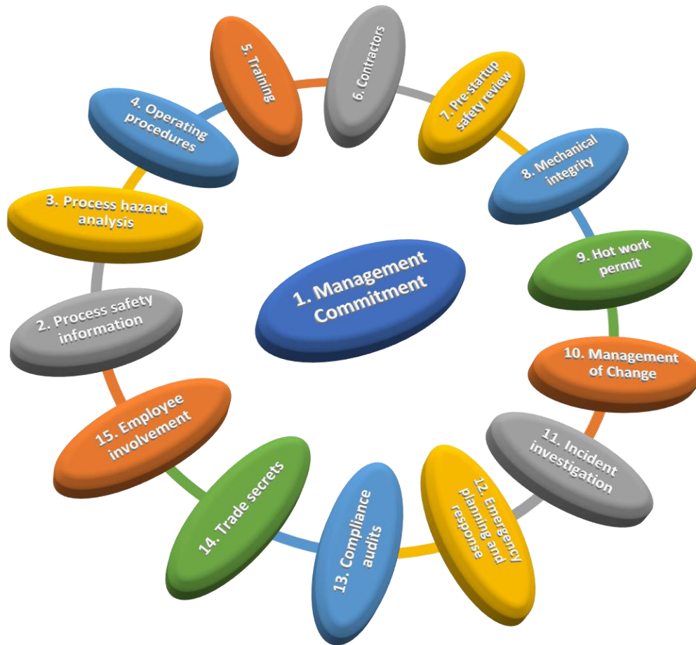
Figure 1. The 15 main elements of the PSM.

process. Operating procedures should be reviewed as often as possible to ensure that they reflect current operating practices, including changes in chemicals, technology, equipment and facilities. They must be certified annually to ensure that they are up-to-date and accurate. It is also important to involve employees in the preparation of process risk analyzes [7].